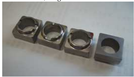
December 2013, Fabricated Replacement Parts

With those problems corrected, the car is in fairly good condition for a 30+ year old restoration. It looks remarkably unchanged from the 1980s year old picture of my grandparents beside it. The paint is old and cracking in places, but will be fine for a long time (I'm not looking for more projects what with having 5 other antique cars).