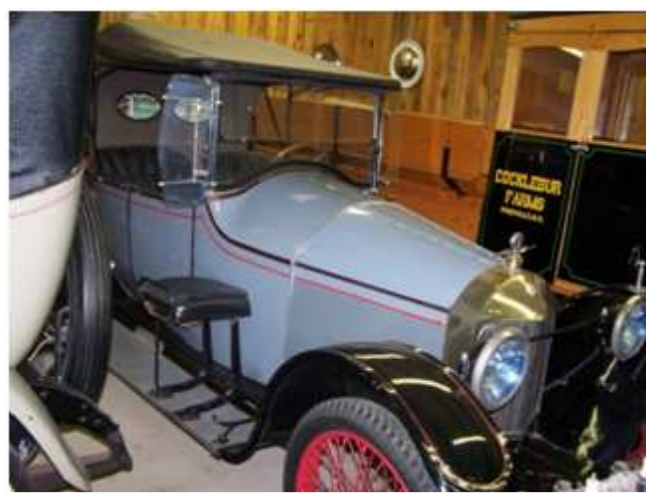
May 2007, Vintage Autos' Other Scripps-Booth

Incidentally, because of these events, when I bought my SB in 2012 it had remained in the exact condition as my grandfather left it when he died in 1992. So, in essence the car is still my grandfather's car. How many people can say that about their grandfather's car?