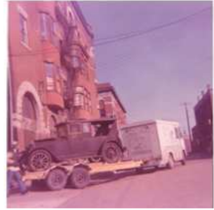
Scripps-Booth after Barney Pollard auction

apparently also a very active in courting public media and he was at least in 3 front page news stories about the car.